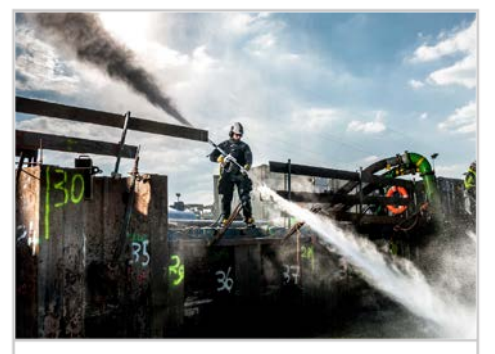
CW1500 Zero Thrust Cavitation Cleaning Gun