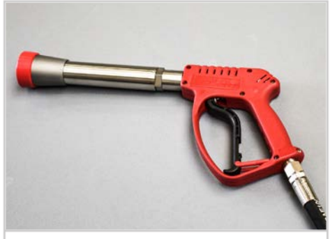
CW200 Short Cavitation Cleaning Gun