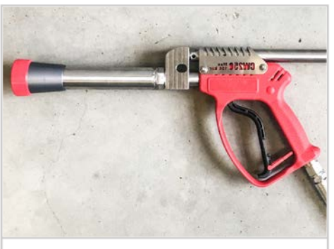
CW250 Short Zero Thurst Cavitation Cleaning Gun